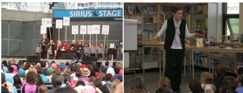
Silver Birch Express Awards (maybe you were there!) Storytelling at Vaughan Willard PS